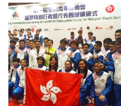
Xtep sponsor HKSAR Delegation of the 1st National Youth Games 特步贊助香港特區代表團參加第一屆全國青年運動會