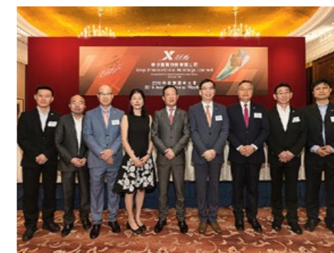
Full Board of Directors attend 2016 Annual General Meeting 全體董事出席2016年週年股東大會