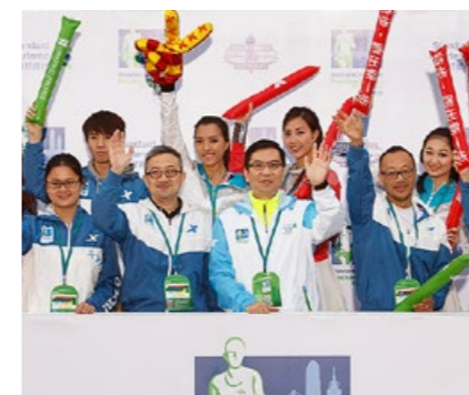
Xtep sponsor Standard Chartered Hong Kong Marathon 特步贊助渣打香港馬拉松