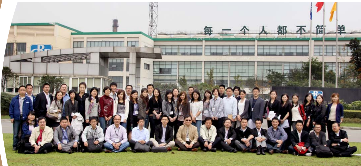
CRE led a group of fund managers and analysts to visit the company's beer business in Sichuan. 華創帶領基金經理及分析員考察公司於四川之啤酒業務。