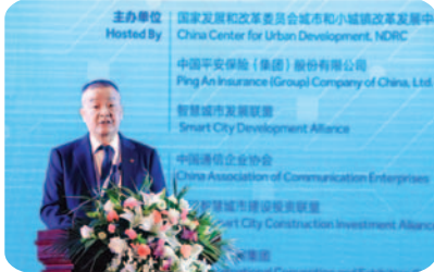
Chairman and CEO Dr Ma Mingzhe delivers a speech at the China Smart City International Expo 董事長兼首席執行官馬明哲博士於中國智慧城市國際博覽會發表演講