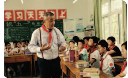
Chairman and CEO Dr Ma Mingzhe volunteers as a teacher at the Hope Primary School 董事長兼首席執行官馬明哲博士于希望小學開展義教