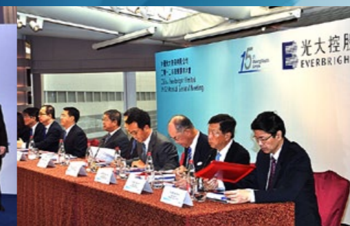
At the 2012 Annual General Meeting of China Everbright Limited 中國光大控股有限公司2012年股東大會現場