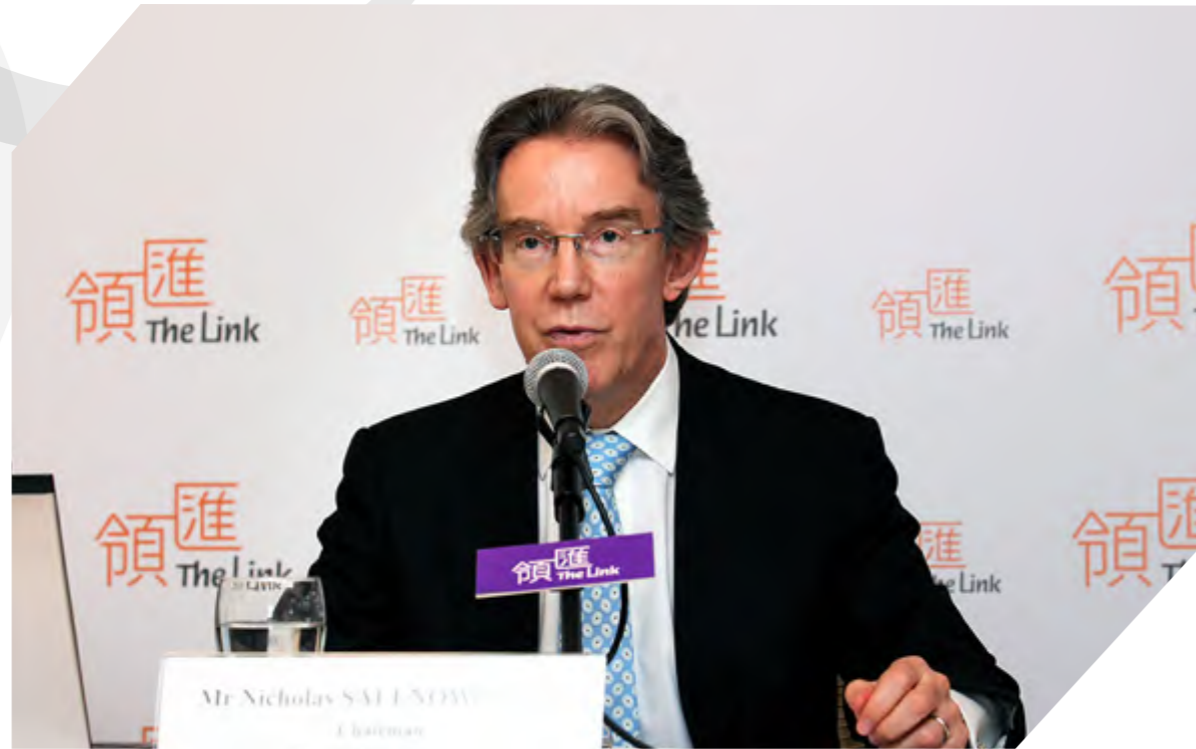
Announcing results of the 2010/11 financial year 公佈2010/11年度的業績