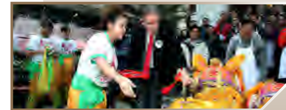
Performing the lion eye-dotting ceremony at the launch of the revitalized Tai Yuen Fresh Market 為活化後的大元街市揭幕，為醒獅點睛