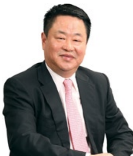
Mr. NING Gaoning, Chairman and Non-executive Director 主席兼非執行董事寧高寧先生

Responsible Directors in Times of Adversity 逆境中 董事 盡職的 董事 Responsible Directors in Times of Adversity 逆境中 董事 盡職的 董事 Responsible Directors