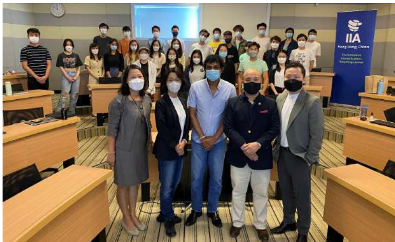
▲ Career talk with IT audit students at the Hong Kong University of Science and Technology. 在香港科技大學的事業講座介紹內審行業變遷