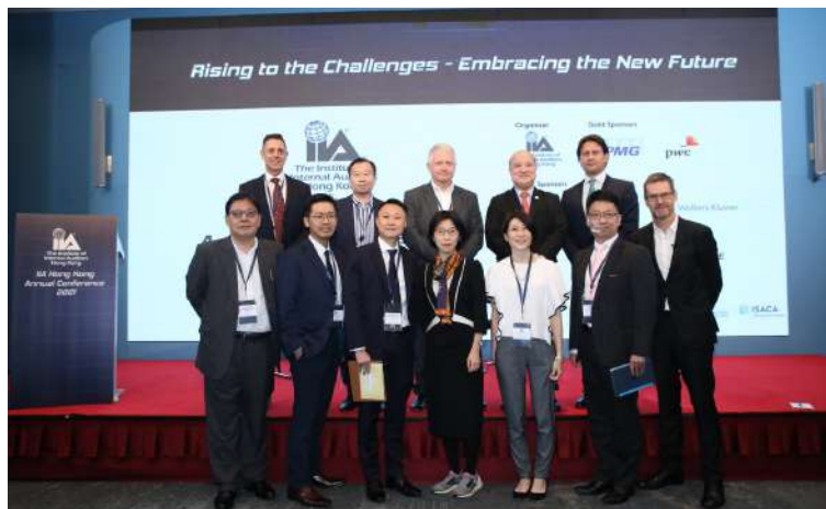
▲ The Institute of Internal Auditors Hong Kong Annual Conference (virtual) during COVID-19. 國際內部審計師協會香港分會在疫情期間舉辦的年會(虛擬)

She believes that all professionals, including auditors, must continue to learn and embrace new things, and be truly open minded so that their existing knowledge and skills do not become a burden to learn new things.