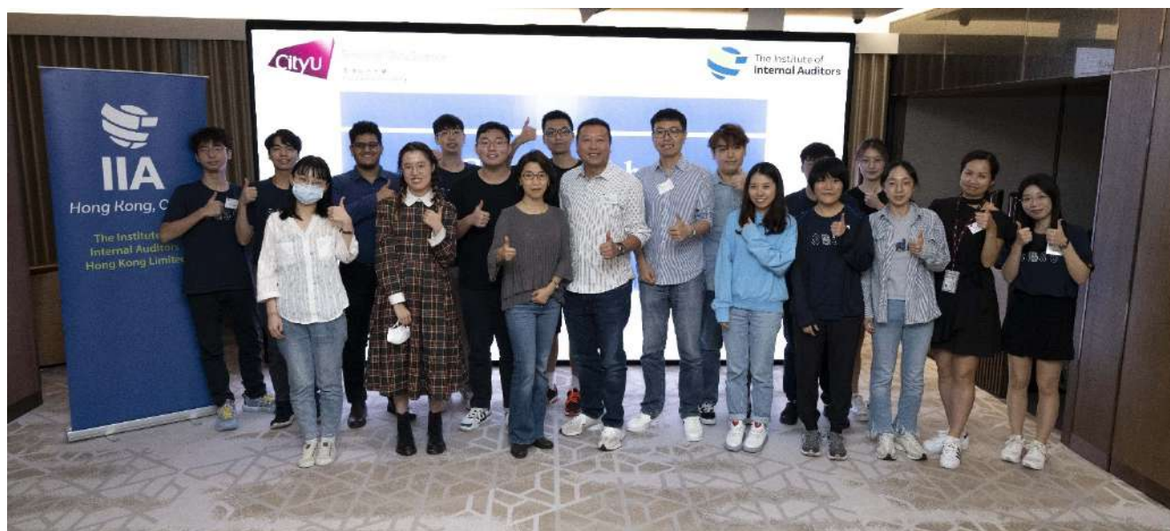
▲ Sharing session with the School of Data Science, City University of Hong Kong 與香港城市大學數據科學院同學分享資料解讀和應用

T he global business and economic environment is constantly changing. Impacted by digitalisation, cyber threats, and climate change etc., any role is fast evolving.