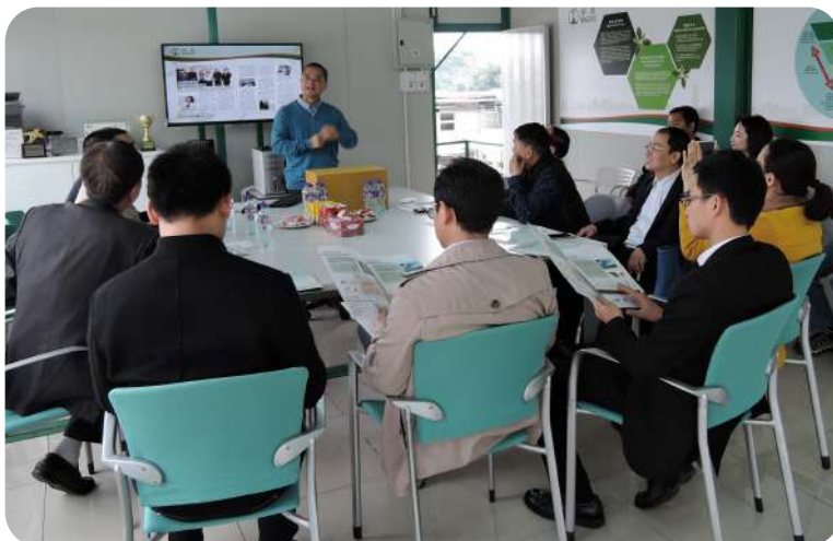
▲ The Board attaches the foremost importance to communication and stays connected with different stakeholders.