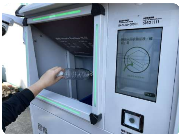
▲ Baguio is moving to intelligent integrated environmental services. 碧瑤向智能化的綜合環境服務邁進。

In addition, Baguio’s Board also made contingency plans and how the company would adjust to maintain basic services after staff infections. This shows the Board is aware of the company’s risks and has