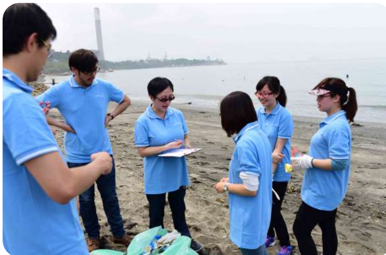
▲ Baguio’s board members and employees participated in CSR activities to support the environmental protection. 碧瑤董事會成員與員工一同參加企業社會責任活動，支持環保。

Members can make better decisions on how to manage the risks only after they fully understand the external environment, the progress of the company and its operations.