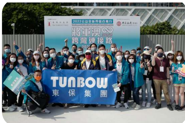
▲ Town Ray actively promotes ESG among employees and encourages them to participate in all aspects of ESG. 登輝管理層積極推動員工關注ESG，鼓勵員工參與ESG各方面的活動。

由此，鄧女士認為董事會和董事可以制定全面的ESG策略、指標和目標，並與持份者接觸，了解他們對ESG的關注和期望。董事個人亦需要加深對ESG專業知識，以確保在決策討論時能夠考慮周詳。