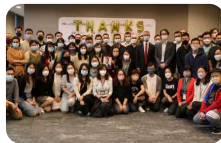
Gathering with staff members. 與員工聚會。