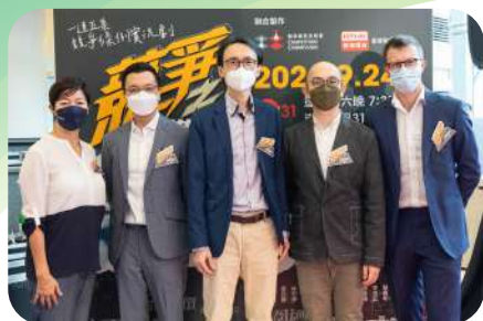
Launch ceremony of COMPETE: Cartel Hunters, Hong Kong's first docudrama series on competition law cases. 香港首套競爭法個案實況劇《競爭之合謀有罪》啟播禮。