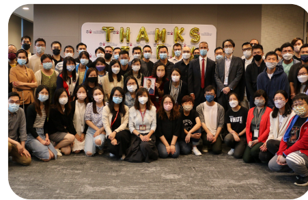
Gathering with staff members. 與員工聚會。