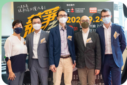
Launch ceremony of COMPETE: Cartel Hunters, Hong Kong's first docudrama series on competition law cases. 香港首套競爭法個案實況劇《競爭之合謀有罪》啟播禮。

HKIoD 25th Anniversary Dinner cum Presentation of Directors Of The Year Awards 2022 香港董事學會25週年晚宴暨 2022年度傑出董事獎頒獎典禮