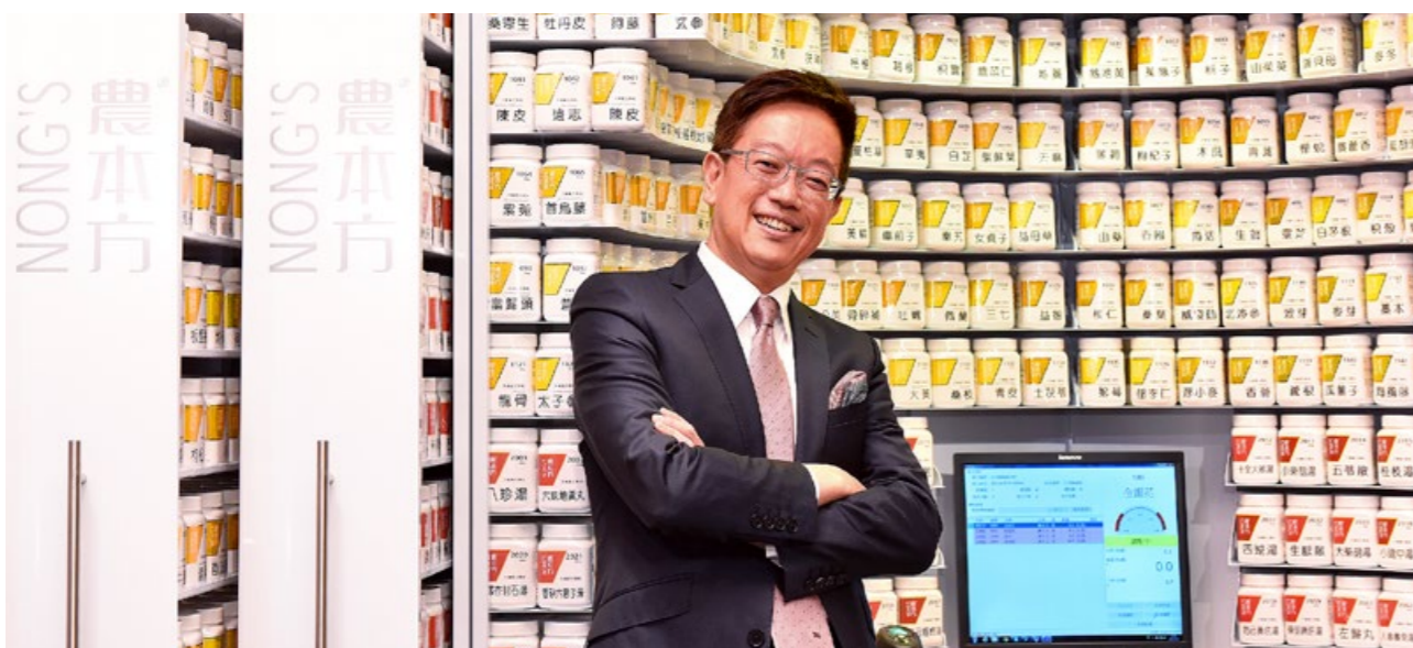
IPO Press Conference 上市新聞發佈會

Founder, Chairman, Chief Executive Officer and Executive Director, PuraPharm Corporation Limited 培力控股有限公司創辦人、主席、行政總裁兼執行董事