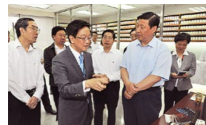
Introduces the business development and products to Mr Xi Jinping, the President of the PRC, at the factory in Nanning 在南寧廠房向國家主席習近平先生介紹業務發展及產品