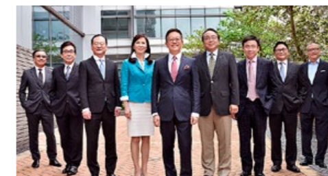
Board of Directors 董事會