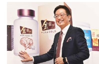
IPO Investor Presentation 上市投資者推介會