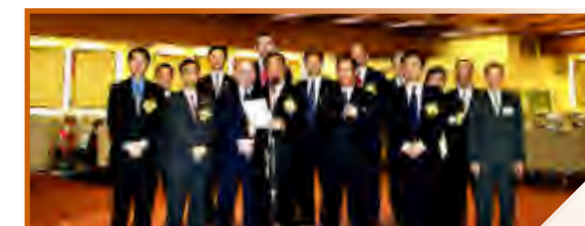
The Board of Directors of Ping An attended the Company's listing ceremony at the Trading Hall of the HKEx 中國平安保險集團董事會於香港聯交所出席公司上市儀式