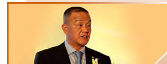
Mr. Ma Mingzhe, Executive Director of Ping An, announced the Company's 2011 Interim Results in Shanghai this August 中國平安保險集團執行董事馬明哲先生今年8月在上海公佈公司2011年中期業績