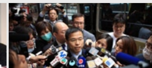
Answering to reporters' queries 解答記者提問