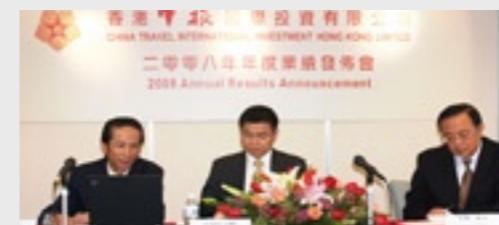
The 2008 Investor Analysis Conference 在2008年度投資者分析會上

2009年的傑出董事選舉以「逆境中盡職的董事」作為主題非常貼切。本人十分珍惜這一榮譽，因為這不僅是對我個人在過去一年中所付出的努力的肯定，也是對香港中旅國際投資有限公司董事會在過一年裡逆境自強的一種肯定。面對金融海嘯和H1N1人型豬流感對旅遊業帶來的巨大沖擊，公司董事會採取措施，加強內部風險控制，整合旅遊資源，有效保障了公司經營管理工作的持續穩定。未來，我將以「傑出董事」的要求鞭策自己，盡職履行董事責任，維護公司管理層、董事會、股東及其他權益相關者的關係規範化，努力提高公司經營管理水平。