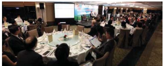
▲ Over 160 participants attend Directors' Symposium 2015. ▲ 逾160名觀眾出席「董事研討會2015」。