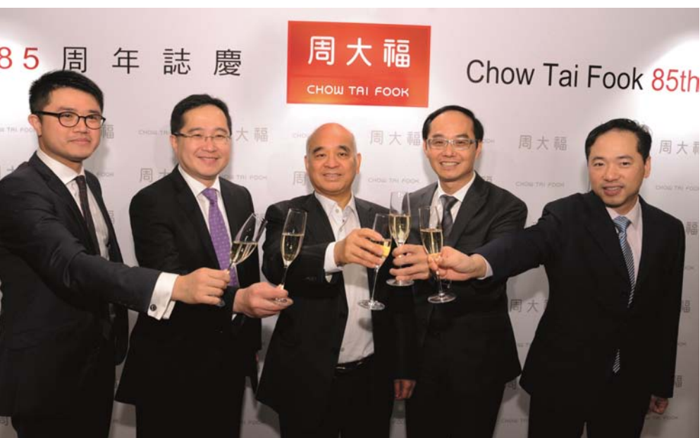
▲ The management of Chow Tai Fook Jewellery Group toasts for the group's 85th Anniversary ▲ 周大福珠寶集團管理層舉杯慶祝集團85周年誌慶